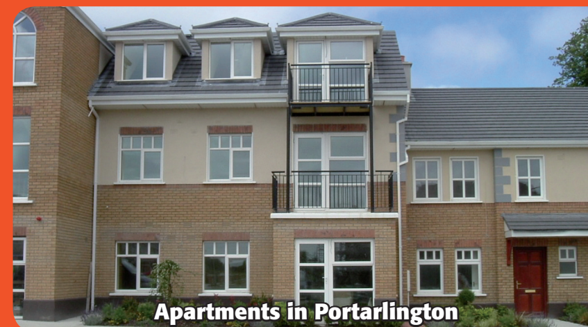
Apartments in Portarlinton