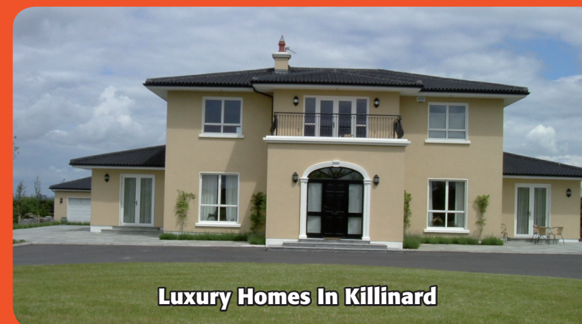
Luxury Homes In Killinard