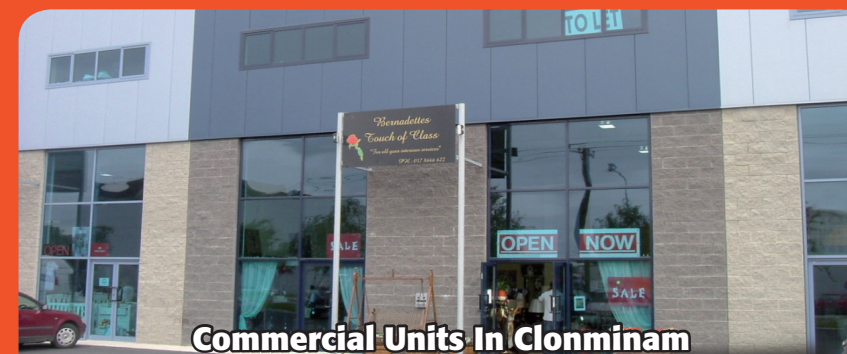
Commercial Units In Clonminam

At Booths our service is customer driven, it is our intention to fulfil our customers requirements, as we can custom manufacturer our product to suit individual requirements.